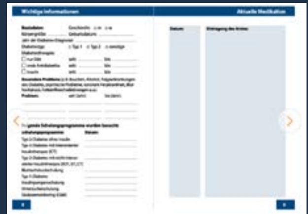
Figure 3 - The diabetes health passport, created as a joint collaboration by the German Diabetes Aid the German Diabetes Society

This guide aims to help patients and their families gain a deeper understanding of how diabetes can affect their eye health by damaging their retina and the various lines of treatment available (figure 4) depending on the progression of the DR.