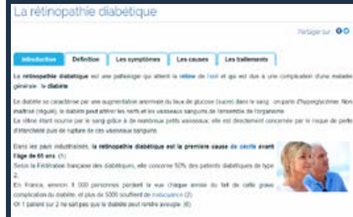
Figure 2 - The Vision Guide with information on Diabetic Retinopathy stages

Created by Cydonia d., an independent publishing company, Le guide de la Vue (figure 2) is a source of information for the general public that is dedicated to vision health, sight, optics and hearing.(38) Information on diabetic eye diseases in the form of short paragraphs and blog posts with relevant pictures and diagrams is available on the website. Information on diabetic eye diseases in the form of short paragraphs and blog posts with relevant pictures and diagrams is available on the website.