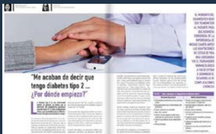
Figure 5 - An article from FSED's "Diabetes" magazine, which is intended to share recent scientific, medical, and care advances with people with diabetes, their families, and the public.

Sociedad Española de diabetes (SED; Spanish Society of Diabetes)