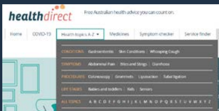
Figure 1- Healthdirect website where patients can search health topics in a variety of ways, such as through symptoms or life stages

Healthdirect Australia is a national virtual public health information service. It provides free, evidence-based health information and advice that enables Australians to manage their health and well-being. The services help people navigate the broader health system and direct them to appropriate, context-specific healthcare. The services help people navigate the broader health system and direct them to appropriate context-specific healthcare. Searchable engines give access to topics based on symptoms or life stages (figure 1); medical advice and a “service finder” for relevant resources.