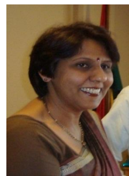
Minister Leela Devi Dookun-Luchoomun

The final report outlining the need for an Observatory on Ageing, its structure and the priority research areas was presented to the government in October 2010.