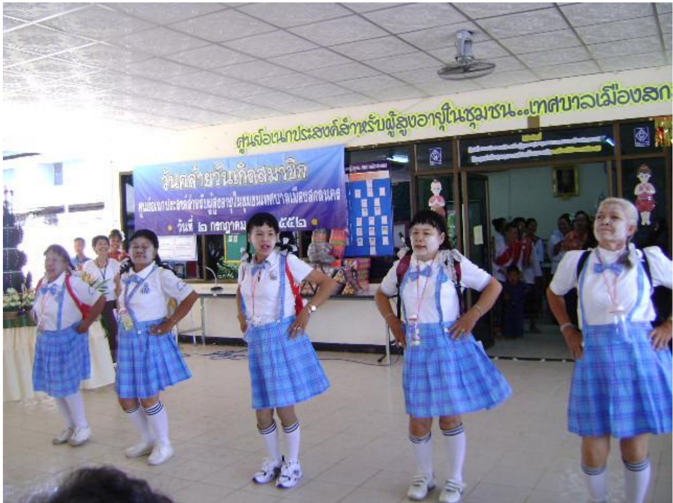
Activities organize by the senior