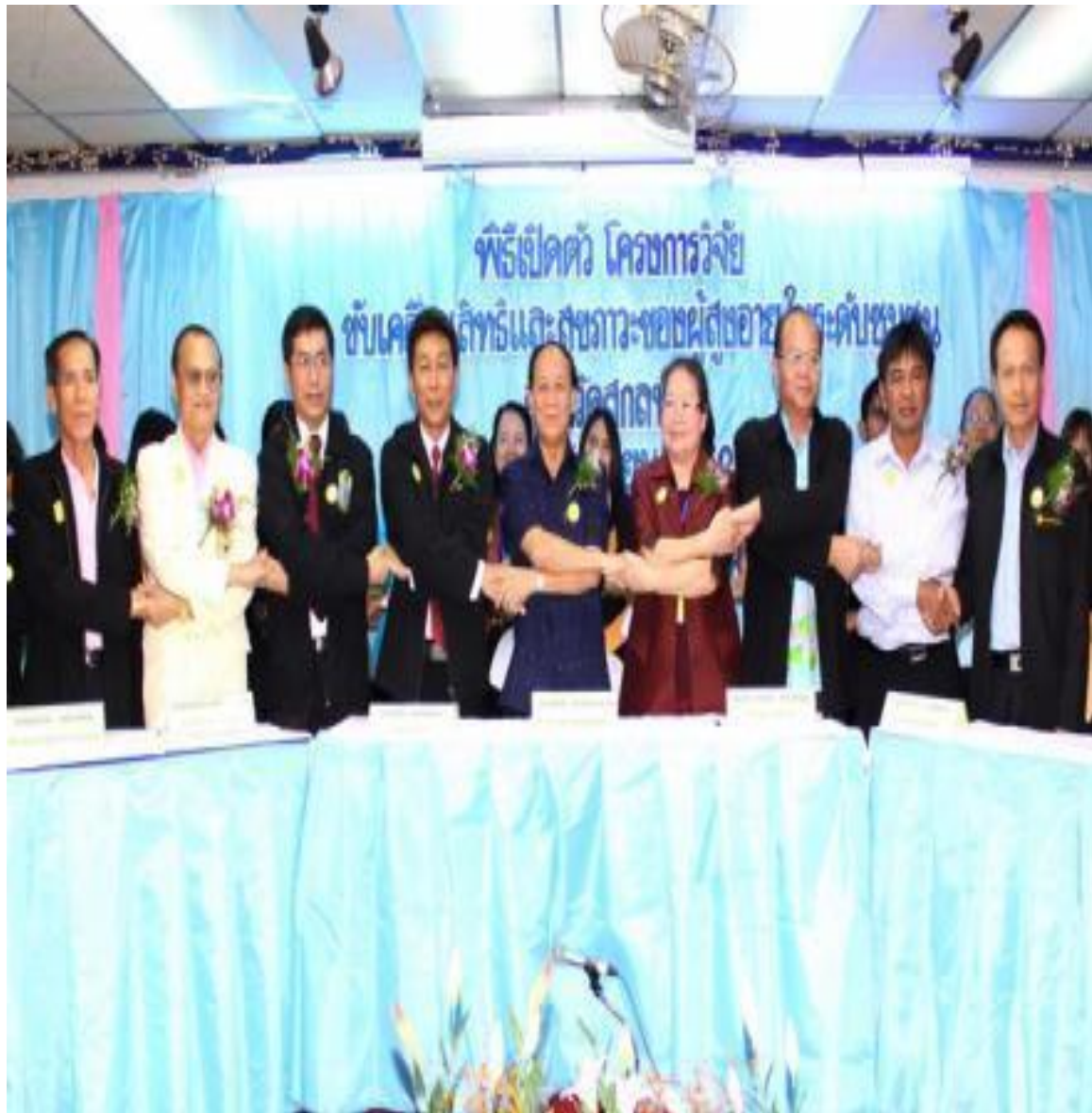
Cooperation with all agencies