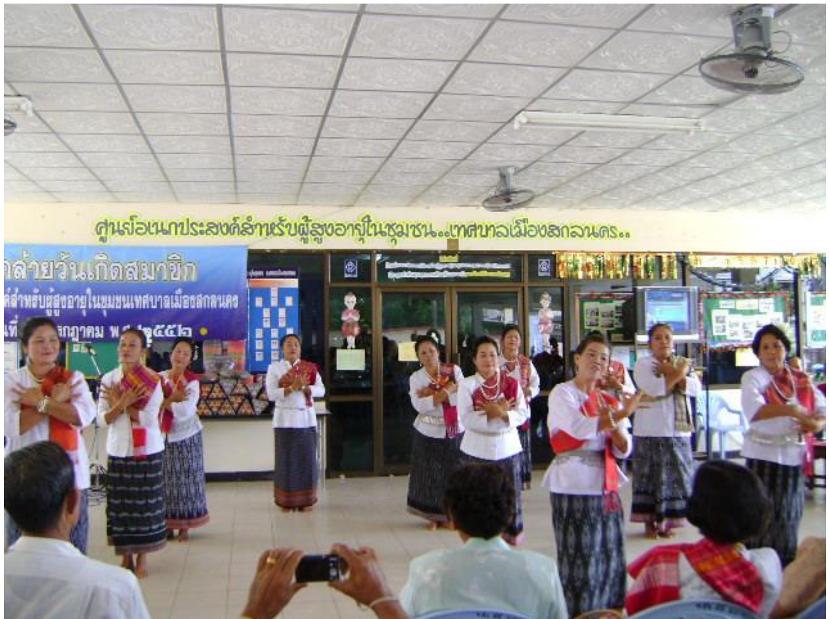
Cultural dance for Welcome Ceremony