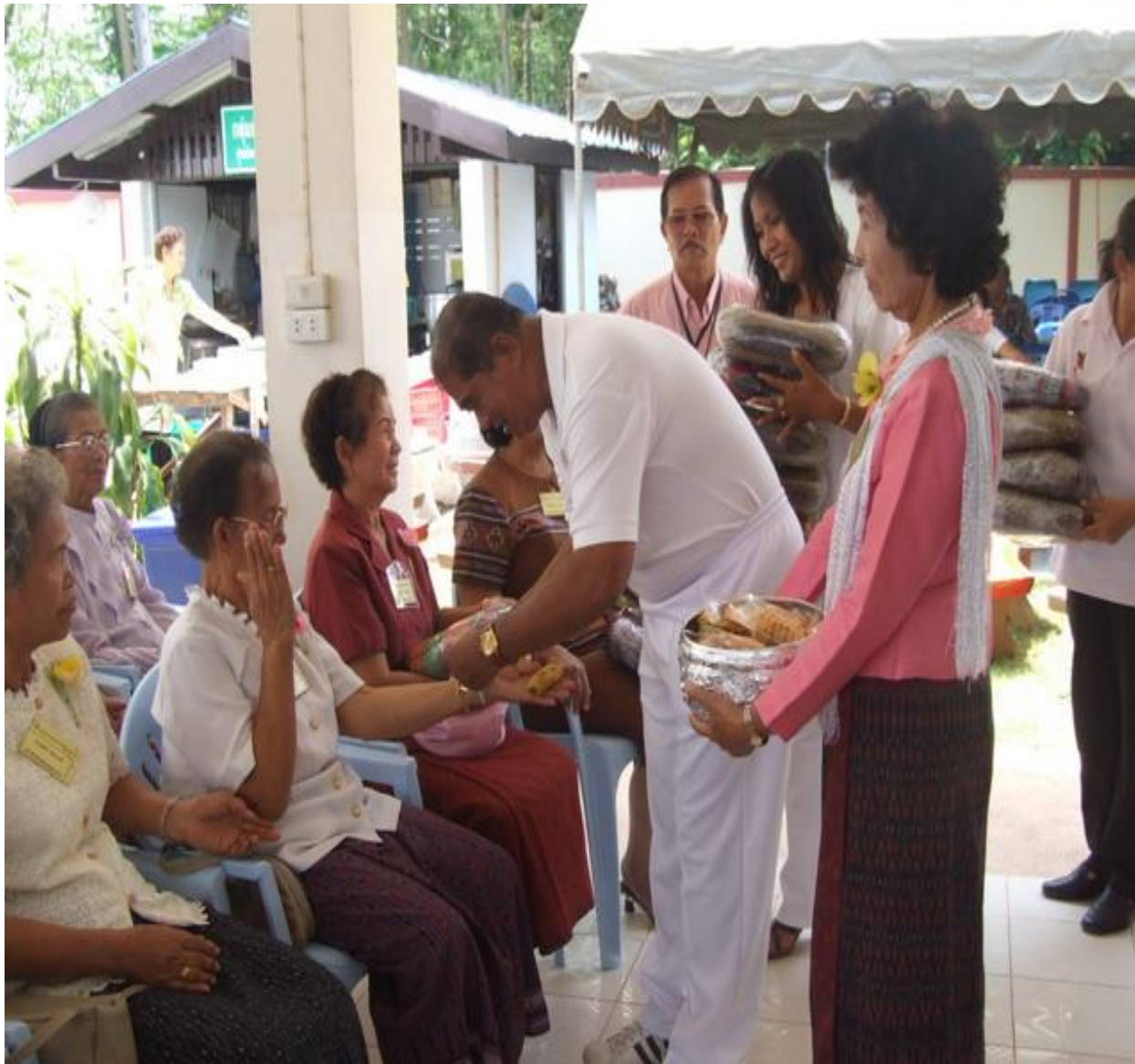
Activities organize by the senior