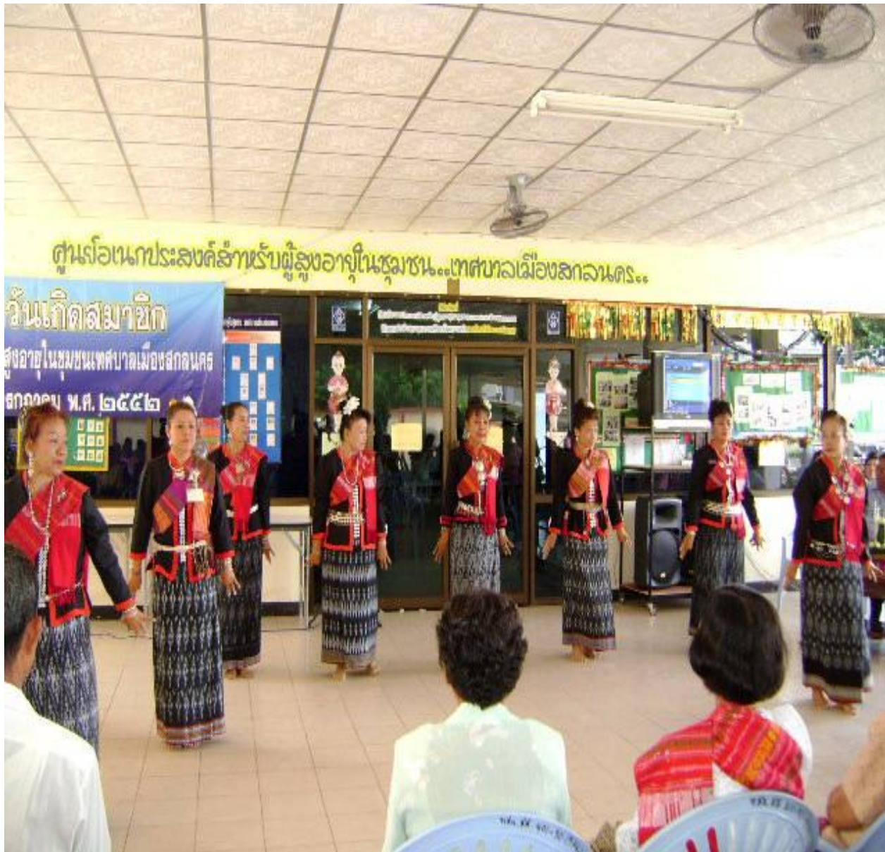
Cultural dance for Welcome Ceremony