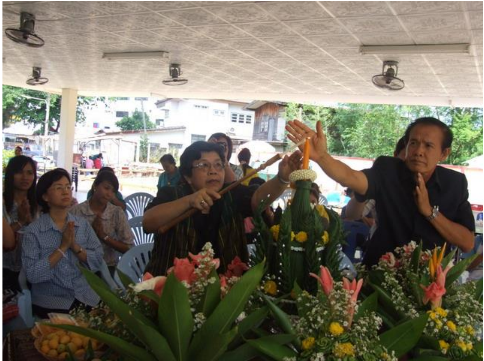
The Center Manager(male) in the Ceremony