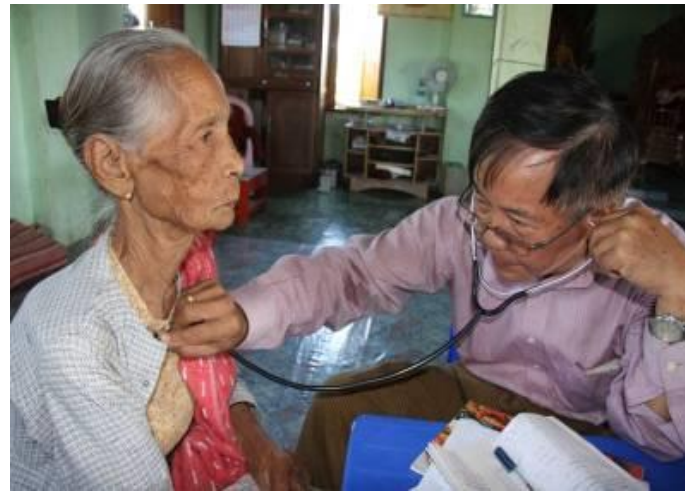
Mobile medical unit