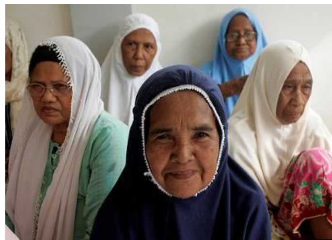
Older people's associations