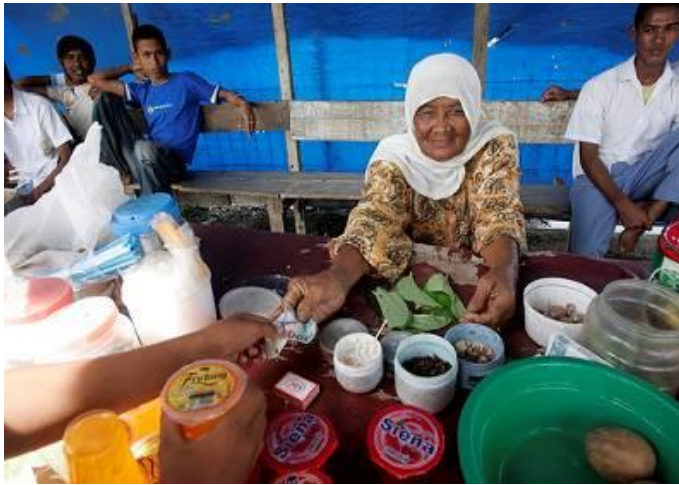
Livelihoods cash grants