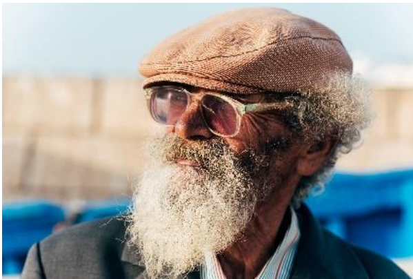
Engaging Older People