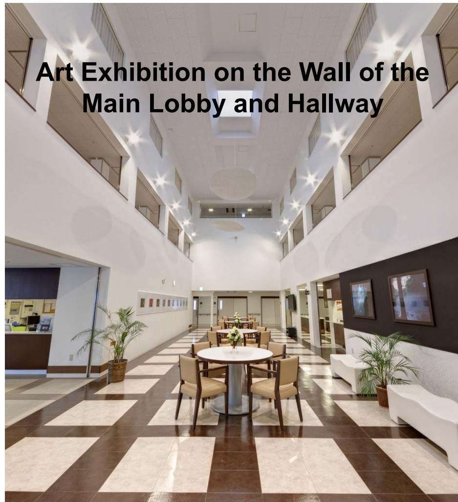
Art Exhibition on the Wall of the Main Lobby and Hallway