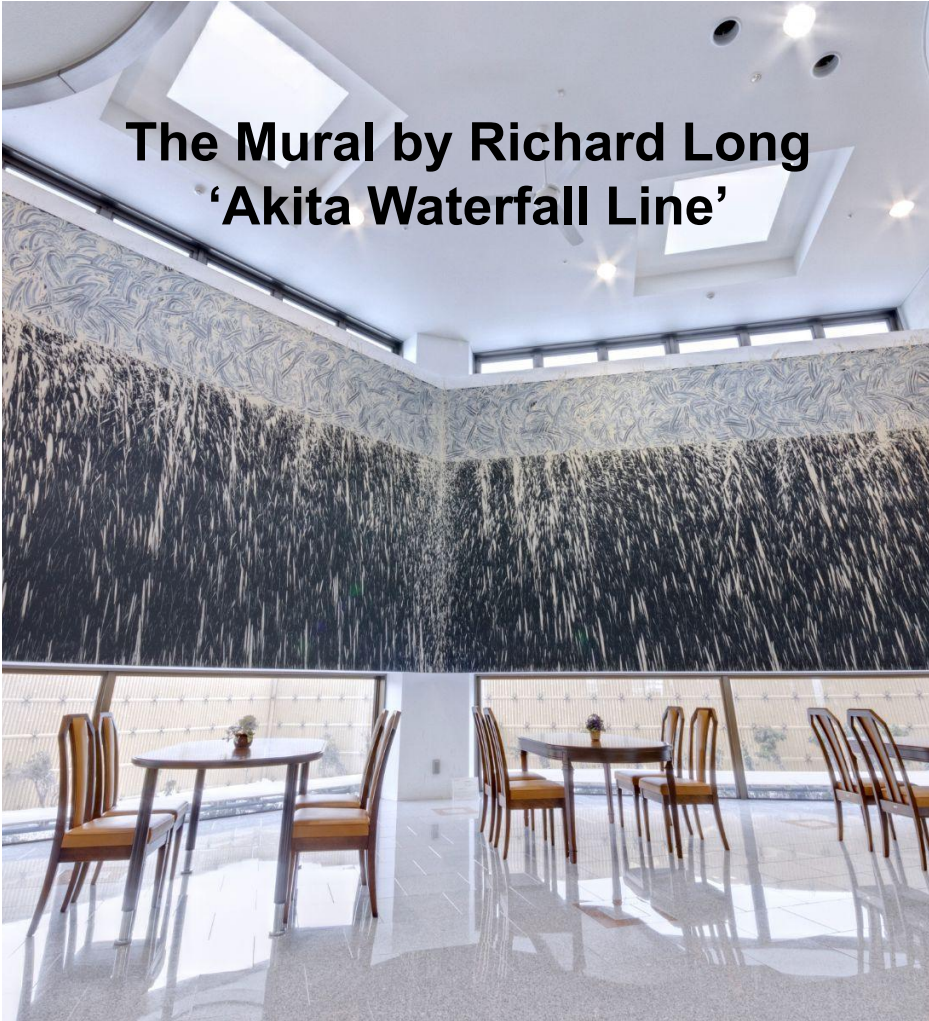
The Mural by Richard Long 'Akita Waterfall Line'