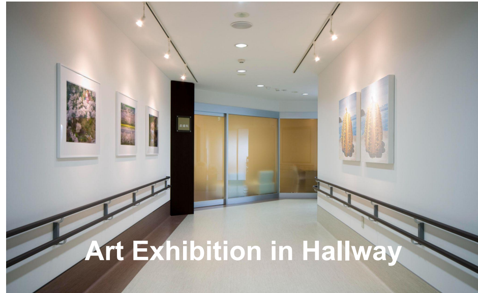
Art Exhibition in Hallway