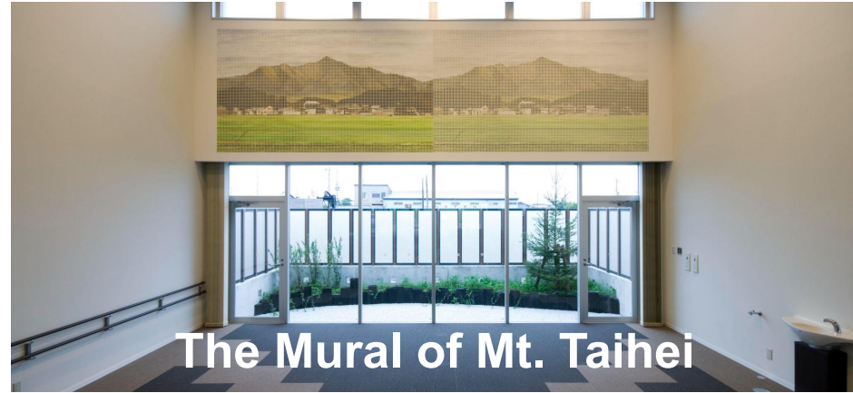
The Mural of Mt. Taihei