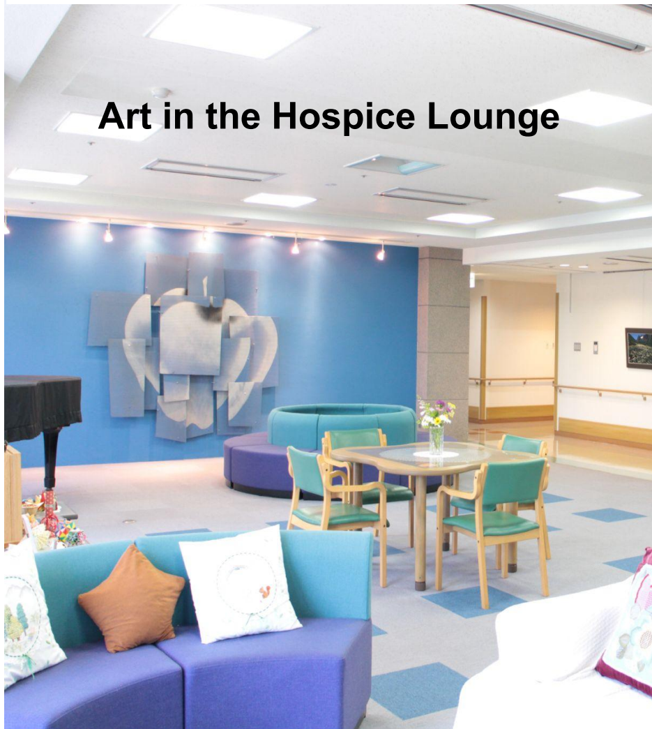
Art in the Hospice Lounge